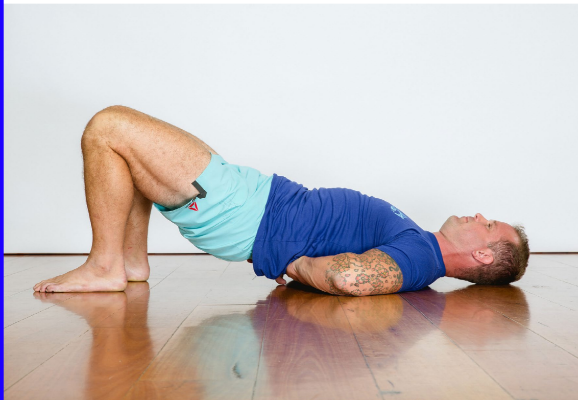
3. To add a tension force, slowly drop your hips toward the floor and lower your back into your hands. From here, you can contract and relax as well as oscillate in and out of end-range tension. WATCH THE VIDEO.

It's important to avoid compensating into a forward-rolled position. Fight this force and control the tension.