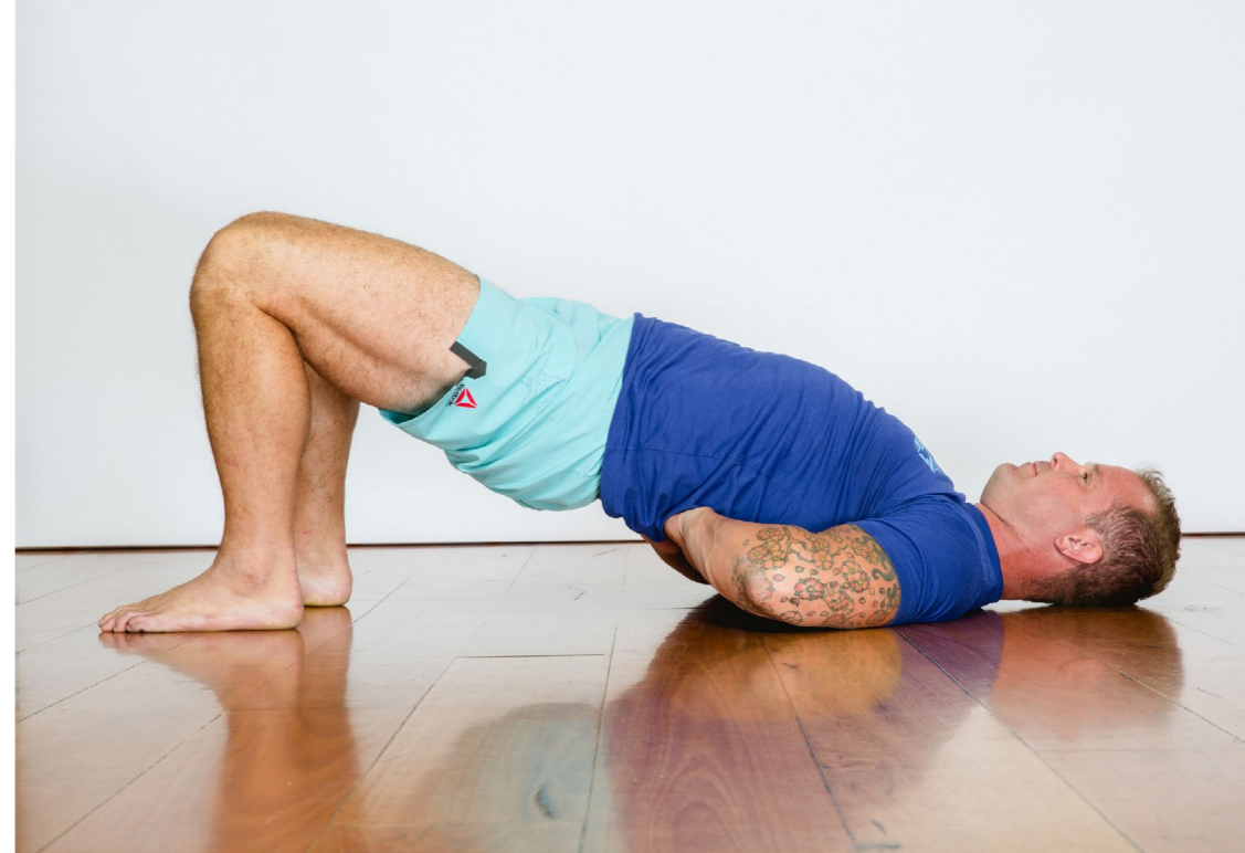
2. Maneuver your hands underneath your lower back.