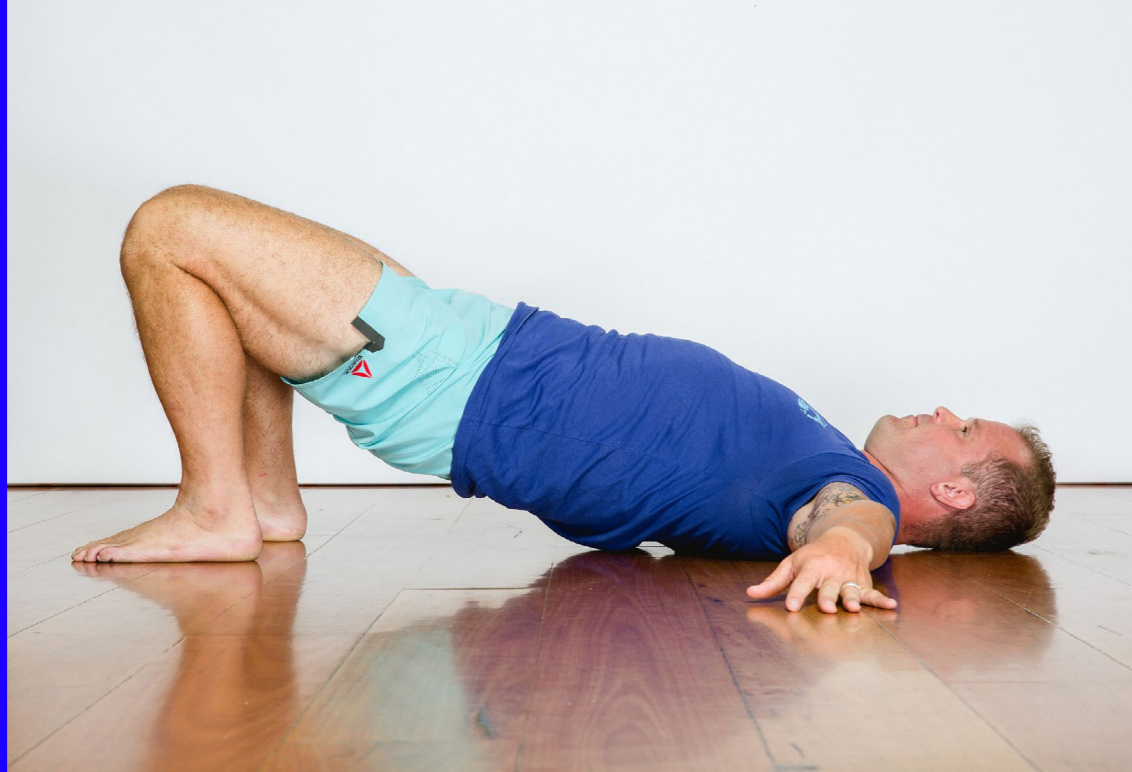
1. Lying on your back, drive your heels into the floor, bridge your hips, and drive your shoulders to the backs of their sockets.